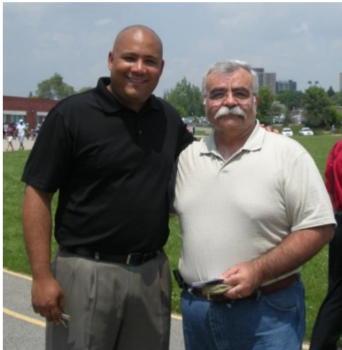
Minister of Citizenship and Immigration Michael Coteau MPP with PEO Councillor Changiz Sadr, P.Eng., on June 23 rd in Toronto.