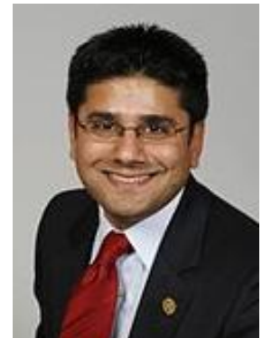
Labour Minister Yasir Naqvi MPP (Ottawa Centre)

Prior to being a Minister, Mr. Naqvi was Parliamentary Assistant to the Minister of Finance. In the past, he has been a supporter of PEO initiatives and events.