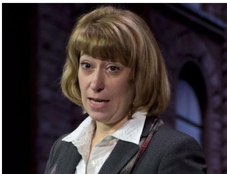
Minister Laurel Broten will step down as the member for Etobicoke-Lakeshore after nearly 10 years effective July 2.