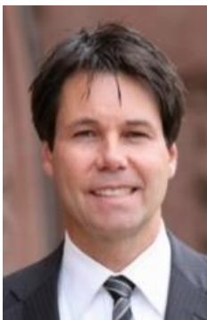
Minister Eric Hoskins MPP