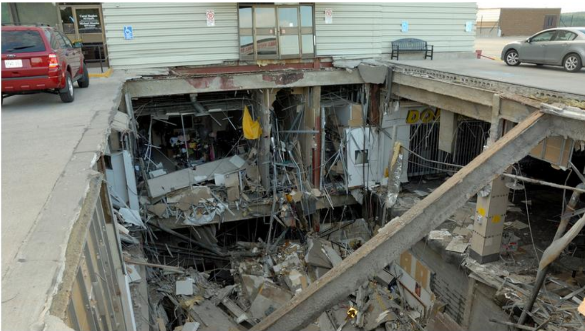
Ontario Provincial Police exhibit showing the collapsed parking lot at the Algo Centre Mall in Elliot Lake, Ont.