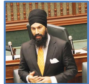
Jagmeet Singh, MPP

The event will bring together engineers from across the GTA to discuss government liaison strategies and to plan for the year ahead. It will be held at PEO headquarters at 40 Sheppard Ave W, in Toronto.