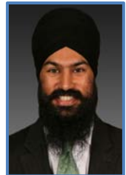
Jagmeet Singh MPP (Bramalea-Gore-Malton)

The East Central and West Central Academy will be held together on December 6 at PEO Headquarters in Toronto where NDP MPP and Attorney General Critic, Jagmeet Singh (Bramalea-Gore Malton), is scheduled to speak.