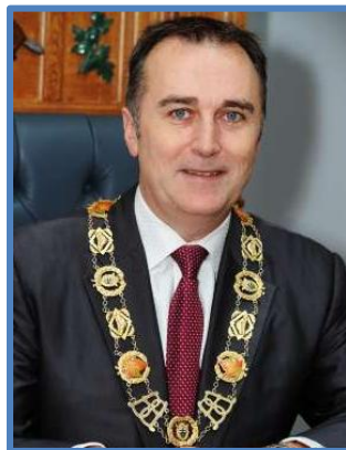
Mayor of Belleville Neil Ellis

Outgoing Belleville Mayor Neil Ellis has just confirmed that he will speak at PEO's upcoming Eastern Region GLP Academy and Congress.