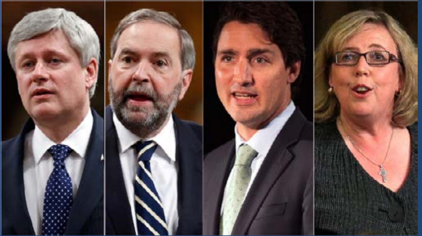
Prime Minister Stephen Harper, Conservative Party Leader (left), NDP Leader Thomas Mulcair MP (Outremont) (centre left), Liberal Party Leader Justin Trudeau MP (Papineau) (centre right), and Green Party Leader Elizabeth May MP (Saanich-Gulf Islands) (right) began to campaign for the 2015 Canadian election which will be held on October 19.

Prime Minister Stephen Harper dissolved Parliament on August 2, ushering Canada into its 42nd general election. The set date of October 19 remains unchanged, which means this will be the longest election in Canada since 1872.