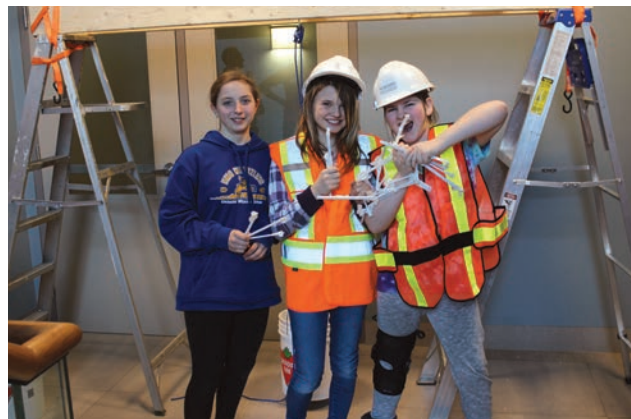
Students have fun during the Student Design Competition hosted by the Lakehead Chapter in collaboration with the OACETT Thunder Bay Chapter.