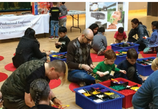
Families participate in the Grand River Chapter's K'NEX Bridge Building Competition.