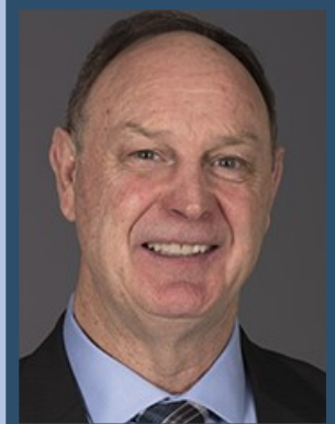
Minister of Natural Resources and Forestry, John Yakabuski , MPP (PC— Renfrew— Nipissing— Pembroke).