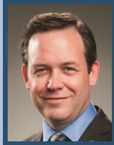
Doug Downey , MPP (Barrie— Springwater—Oro-Medonte), Attorney General of Ontario.