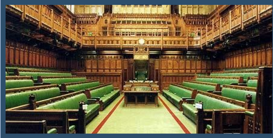
House of Commons

Engineers Canada has released a list of engineers running in the 2019 federal election.