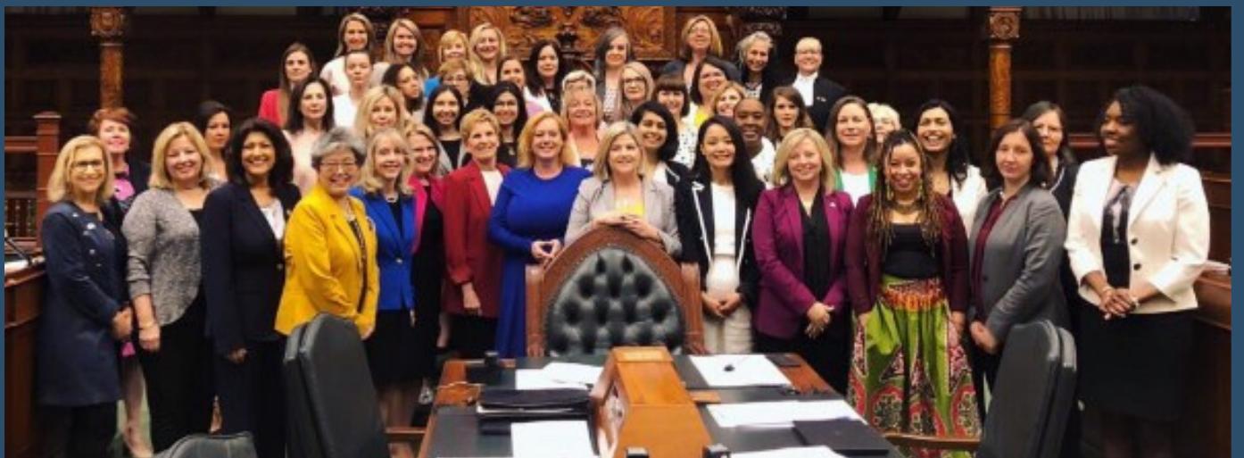
The 49 female MPPs of the 42nd Parliament of Ontario on June 5 at Queen's Park.

Before the Ontario legislature was adjourned, all female MPPs posed for a photo which was published in Queen's Park Daily .