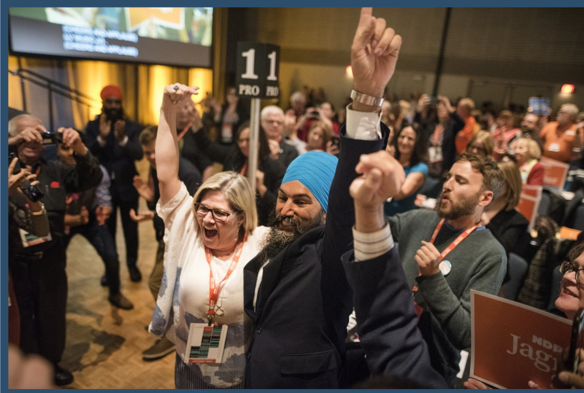
Ontario New Democratic Party Leader Andrea Horwath , MPP (Hamilton Centre) with federal NDP leader Jagmeet Singh , MP (Burnaby South) at the Ontario NDP's 2019 Convention held from June 14 to 16 at the Hamilton Convention Centre.

(HAMILTON) — The Ontario New Democratic Party held their annual convention from June 14 to 16 at the Hamilton Convention Centre.