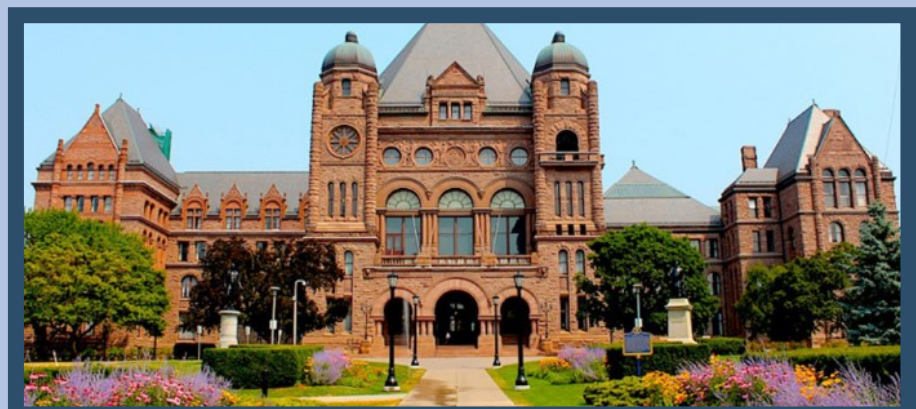
The Ontario Legislative Building in Toronto.

In a statement, they cited the “unprecedented pace” at which they have legislated and how they have accomplished 38 platform commitments.