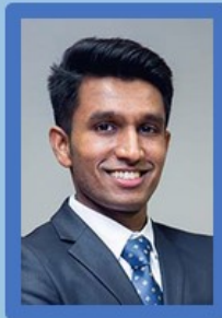
Vijay Thanigasalam , MPP (Scarborough—Rouge Park), Parliamentary Assistant to the Minister of Transportation ( NEW )