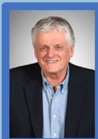
Toby Barrett , MPP (Haldimand—Norfolk), Parliamentary Assistant to the Minister of Agriculture, Food and Rural Affairs (Agriculture and Food) ( PREVIOUSLY Natural Resources and Forestry)