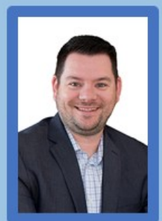
Mike Harris , MPP (Kitchener—Conestoga), Parliamentary Assistant to the Minister of Natural Resources and Forestry ( NEW )