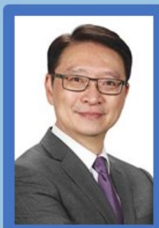
Billy Pang , MPP (Markham—Unionville), Parliamentary Assistant to the Minister of Tourism, Culture and Sport (Tourism) (NEW)