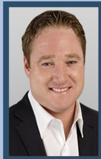
International Trade Critic Taras Natyshak (NDP—Essex)