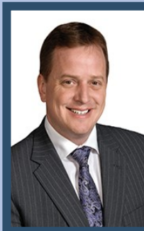
Minister of Transportation Jeff Yurek (PC—Elgin - Middlesex - London)

Previous Western Region GLP meetings have been held in Cambridge, London, Hamilton, Collingwood and Goderich.