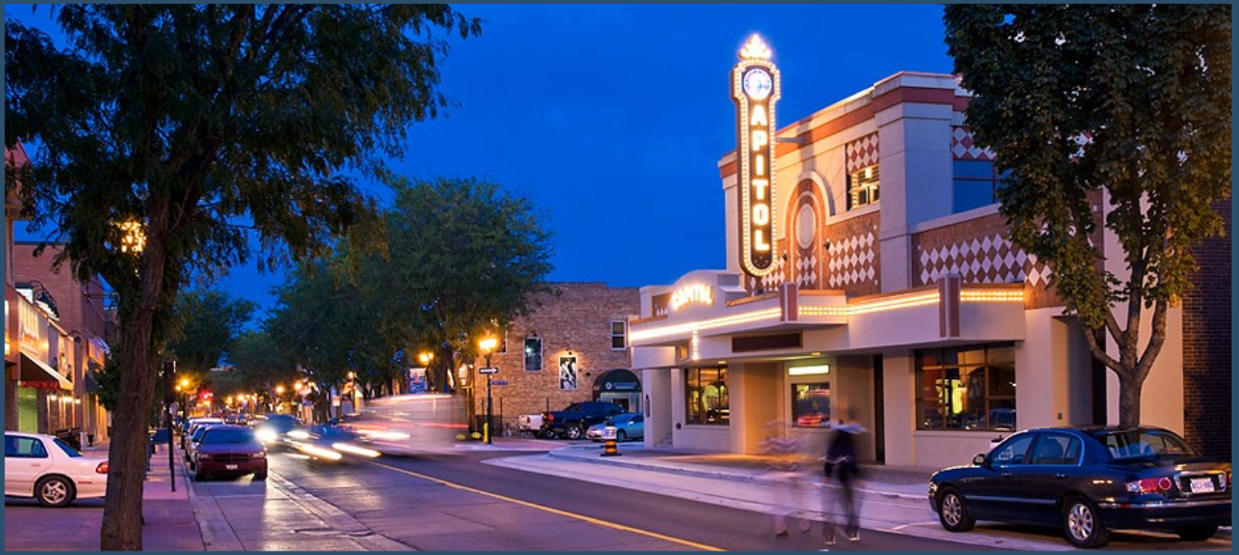
PEO Western Region GLP Academy will be held in Chatham in May.

(CHATHAM) - The 2019 PEO Western Region GLP Academy will be held in the historic downtown district of Chatham on May 11. The meeting will take place at the Retro Suites Hotel.