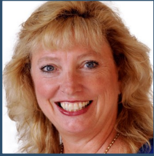
Marilyn Gladu, P.Eng., MP (Sarnia- Lambton)