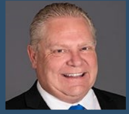
Premier Doug Ford, MPP (Etobicoke North)