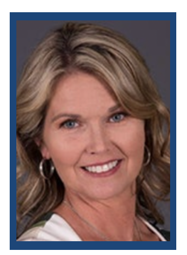
Hon. Jill Dunlop , MPP (Simcoe North)

Hon. Jill Dunlop , MPP (Simcoe North) was first elected to the Ontario Legislature as a member of the Progressive Conservative Party in 2018.