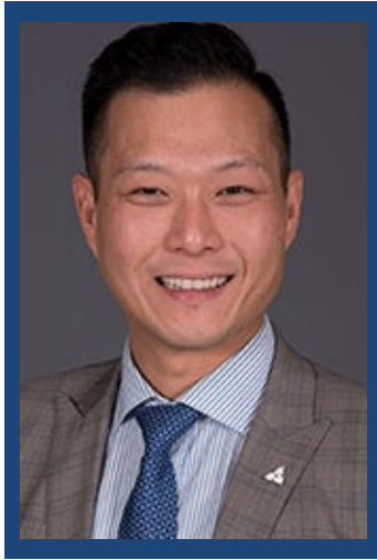
Hon. Stan Cho , MPP (Willowdale)

This week, the GLP Weekly Times features Hon. Stan Cho , MPP (Willowdale) Associate Minister of Transportation (GTA) and Jennifer French , MPP (Oshawa) NDP Critic for Infrastructure, Transportation and Highways.