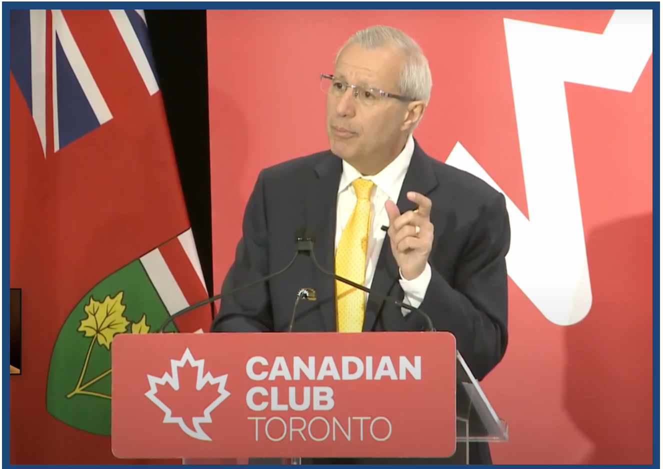
Vic Fedeli , MPP (Nipissing), Minister of Economic Development, Job Creation and Trade spoke at the Canadian Club of Toronto on April 12.