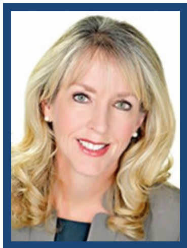
Hon. Merrilee Fullerton , MPP (Kanata-Carleton)

Hon. Merrilee Fullerton , MPP (Kanata-Carleton) was first elected to the Ontario Legislature as a member of the Progressive Conservative Party in 2018.