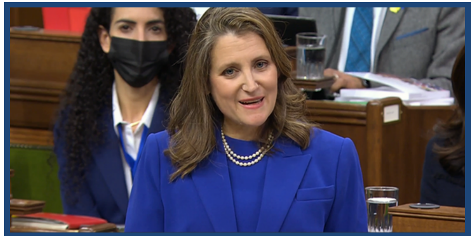
Deputy Prime Minister and Minister of Finance Chrystia Freeland presented the federal budget on April 7.