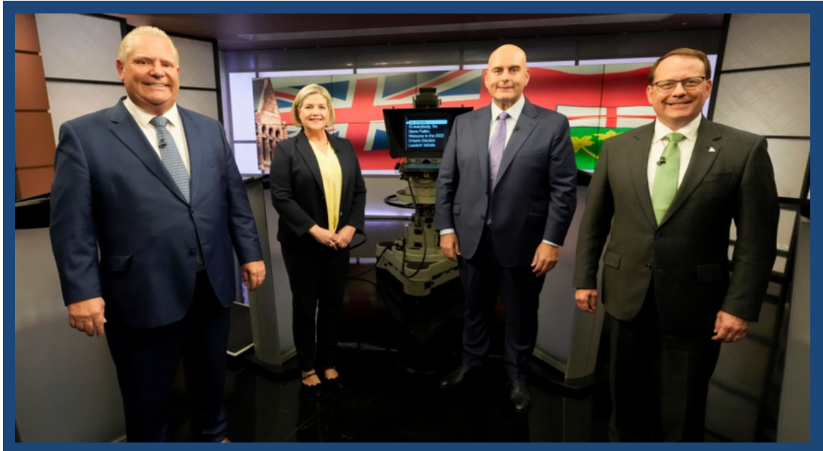
The four party leaders (from left to right) PC's Doug Ford, NDP's Andrea Horwath, Liberal's Steven Del Duca and Green's Mike Schreiner at the second provincial election debate on May 16.