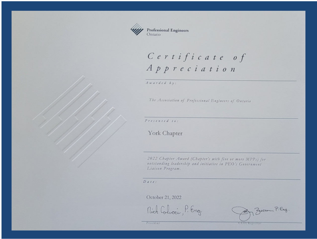
Photo of a sample completed certificate.

The event concluded with an awards ceremony that celebrated chapters with the most MPP interactions in the last 12 months. These GLP Certificates of Appreciation were awarded to five chapters.