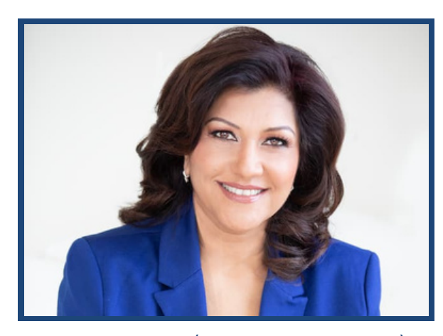
Nina Tangri, MPP (Mississauga-Streetsville) assumed the role of Associate Minister of Housing on March 24.