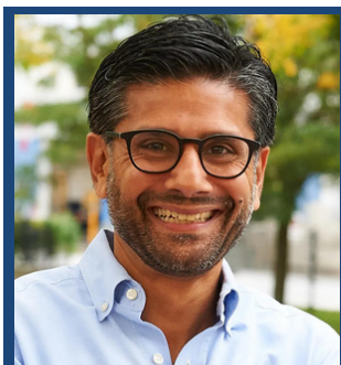
Yasir Naqvi , MP (Ottawa Centre)