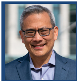
Ted Hsu , MPP (Kingston and the Islands)