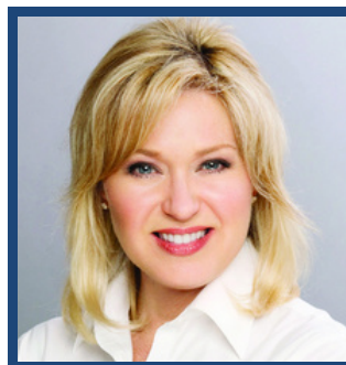
Bonnie Crombie Mississauga Mayor