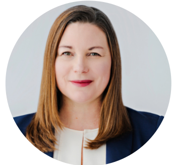
MPP Catherine Fife (Waterloo)