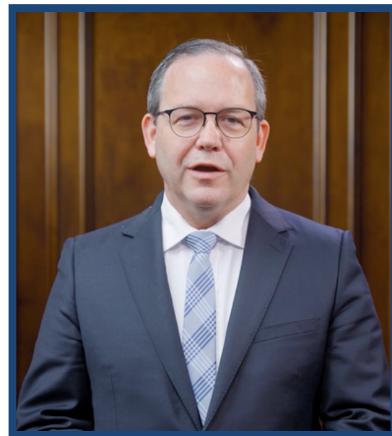
Attorney General Doug Downey (Barrie-Springwater-Oro-Medonte)

We also made mandatory the Professional Evaluation and Knowledge program, ensuring continued education and professional development for all license holders. These changes improve your profession, while enhancing public trust in engineering.