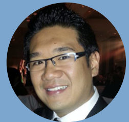
Sherlock Sung, BAsc. Lieutenant Governor Appointee