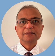
Uditha Senaratne, P.Eng. Lieutenant Governor Appointee