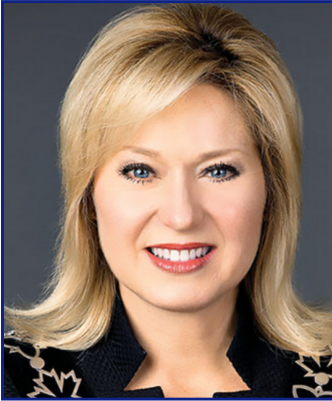
Bonnie Crombie Mississauga Mayor