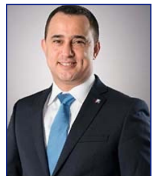
Hon. Michael Parsa, MPP (Aurora—Oak Ridges—Richmond Hill)