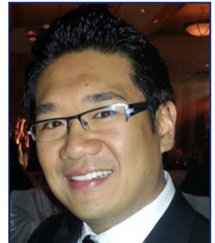
Sherlock Sung, B.A.Sc. Lieutenant Governor-in-Council Appointee

An update that PEO has today rolled out the new online licence application process to align with the Fair Access to Regulated Professional and Compulsory Trades Act (FARPACKTA) amendments in advance of July 1, 2023. More details here: https://www.peo.on.ca/latest-news/peos-new-licence-application-process-launches-today