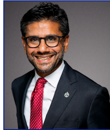
Yasir Naqvi MP (Ottawa Centre)