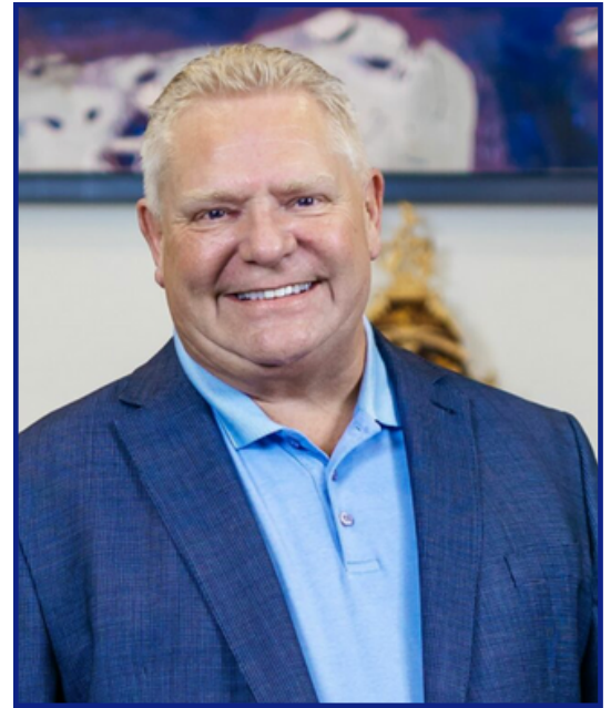
Doug Ford , MPP (Etobicoke North)

He also had a successful business career with Deco Labels.