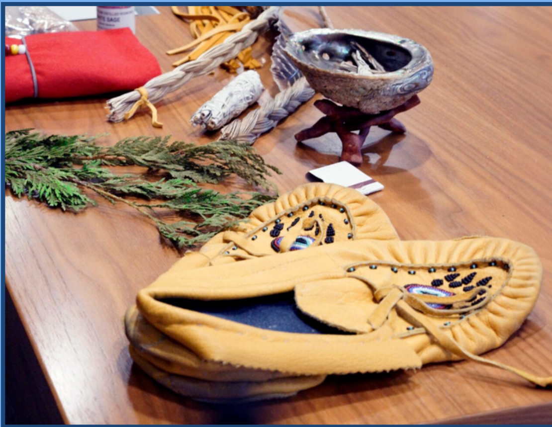
PEO staff created an informative display of Indigenous items to share with participants