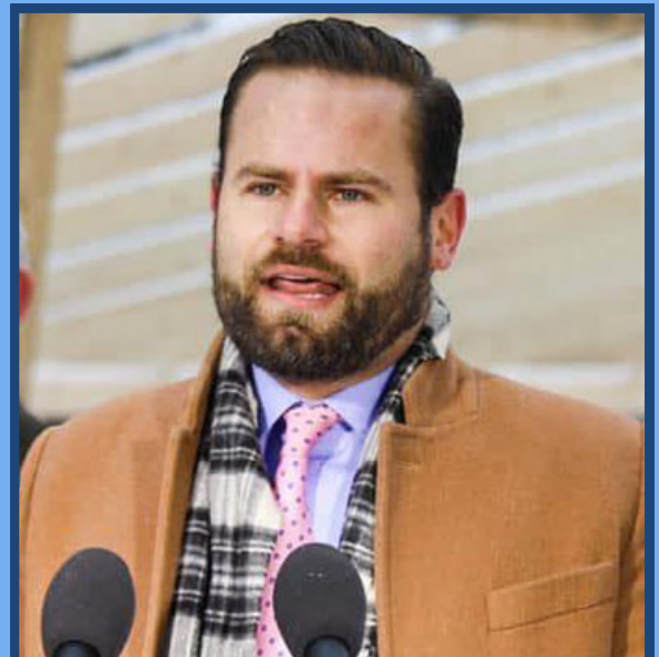
Labour, Immigration, Training and Skills Development Minister David Piccini , MPP (Peterborough--Northumberland) announced the changes as part of the province's most recent Working for Workers Act on November 14th.

PEO was also referenced in the media release by the Ministry of Labour, Immigration, Training and Skills Development in their announcement of the changing of work requirements. To read the ministry's media release, click here .