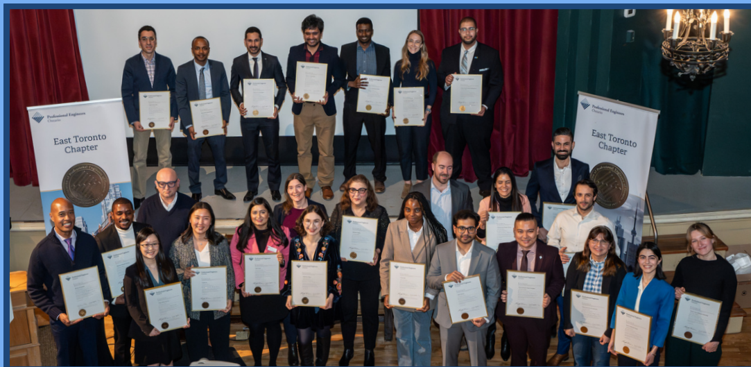
Licence recipients celebrate following their ceremony at the Arts and Letters Club on January 10.