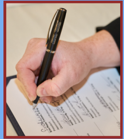
An image from the 2024 Engineers Canada Annual Meeting capturing the significant moment when the National Statement of Collaboration was signed on May 23.