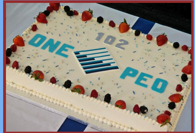
PEO's 102nd birthday cake with the theme, "One PEO".

PEO celebrated its 102nd anniversary on June 14. The day marked over a century of dedication to protecting the public interest through the regulation of the engineering profession in Ontario. Congratulations PEO!