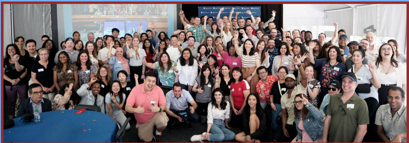
PEO staff celebrating the regulator's 102nd anniversary and over a century of regulatory excellence.

To celebrate this special occasion, PEO arranged for an exciting day at the Toronto Zoo for their staff.