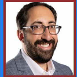
Jonathan Lebi Deputy Minister of Environment, Conservation & Parks