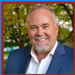
Todd Smith, Former MPP (Bay of Quinte)