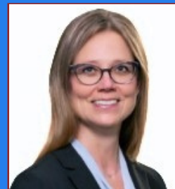
Susanna Laaksonen-Craig Deputy Minister of Energy & Electrification