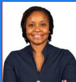
Nosa Ero-Brown Deputy Minister of Citizenship & Multiculturalism