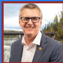
Kevin Holland, MPP (Thunder Bay— Atikokan)