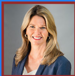
Jill Dunlop, MPP (Simcoe North)