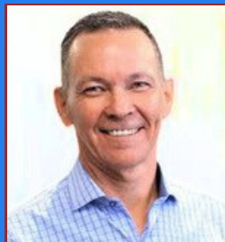
Shawn Batise Deputy Minister of Mines