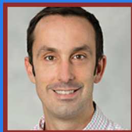
Nolan Quinn, MPP (Stormont—Dundas —South Glengarry)