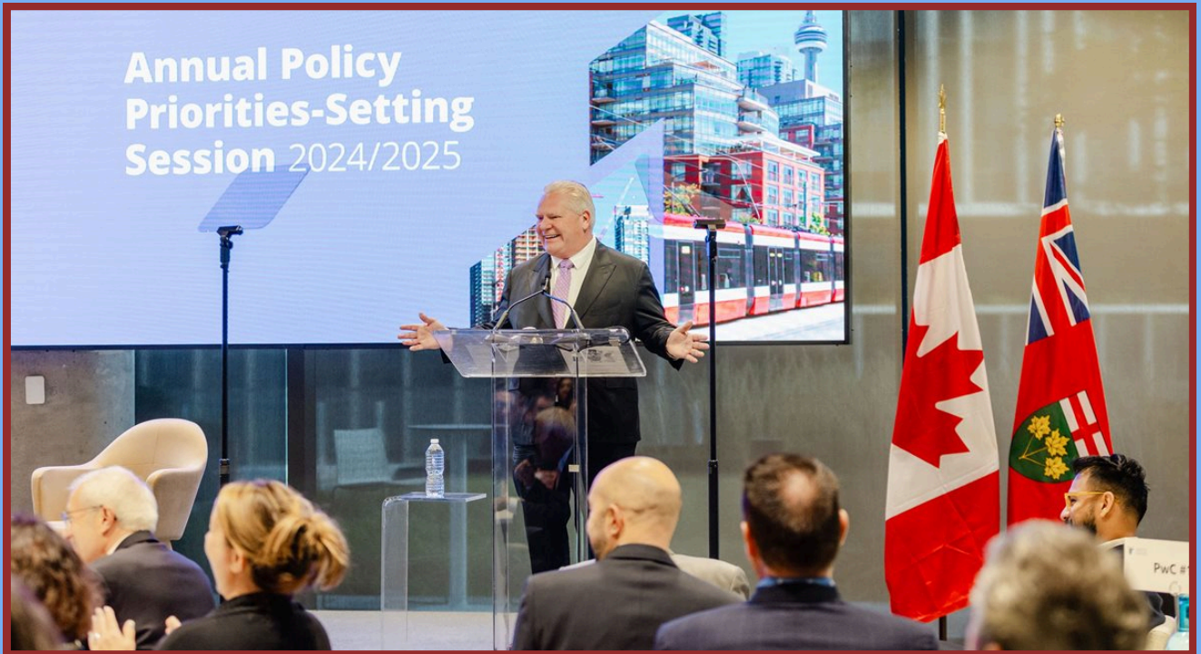
Premier Doug Ford , MPP (Etobicoke North), spoke at the Toronto Region Board of Trade's Annual Policy Priorities-Setting Session on September 12.