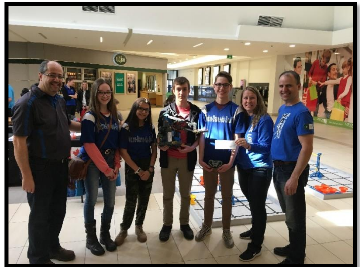
The Notre-Dame-du-Sault VEX Robotics team