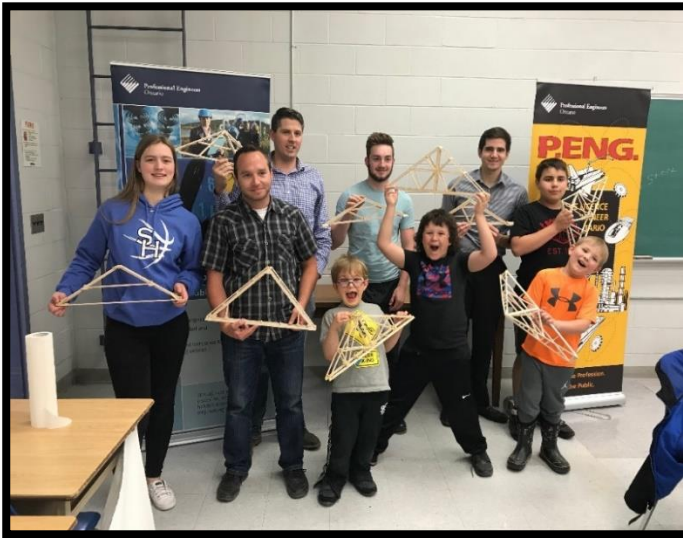
PEO and High School Volunteers with Kids from the Algoma Autism Foundation

After the success of the Bridge Building Competition, the Algoma Autism Foundation contacted PEO to organize a special competition for their members. PEO facilitated a three (3) week program assisting the kids in building bridges and hosting a “mini competition” upon completion. There was no cost to the Autism Foundation to run this event thanks to the sponsors of the bridge building competition and the remaining kits/supplies available.