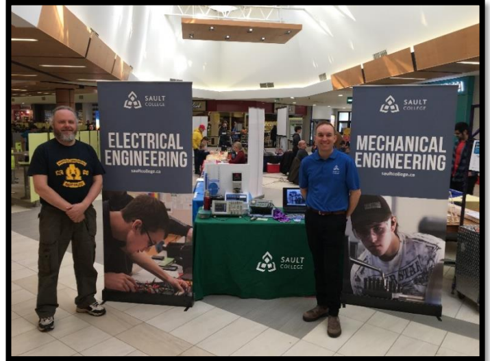
Sault College displays information pertaining to their Electrical and Mechanical Engineering programs

On March 23rd, Volunteers from the Algoma Chapters of PEO and OACETT hosted the annual National Engineering Day activities at the Station Mall in Sault Ste. Marie, Ontario, as part of the larger National Engineering Month Activities. This included the annual Math competition, where over 30 participants from local schools in Grades 6 through 12 competed for funding to pursue a STEM education. There were also Engineering based arts and crafts for children of all ages, and displays from local engineering consultants and businesses. Additional presenters at this year's event included several of the VEX robotics teams from the local schools, representatives of Lake Superior State University, Algoma University, Sault College, and display tables from Algoma Steel, Total Precision and Maker North.