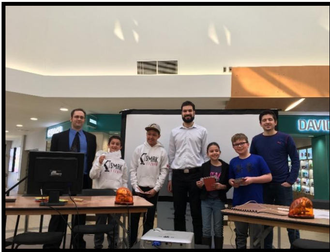
Winners of the Math Contest for the Grade 5/6 Category