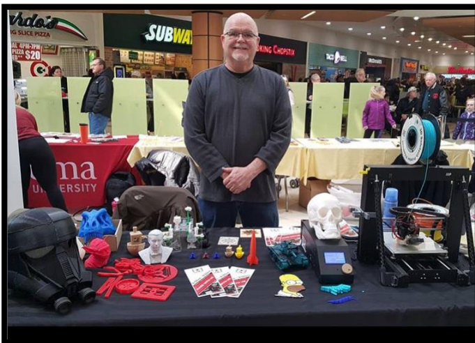
Maker North show casing some 3D prints