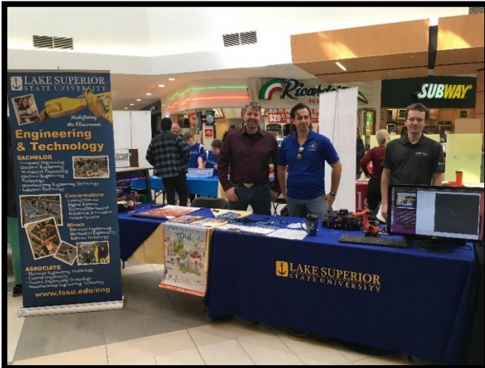
Lake Superior State University displays information pertaining to their Engineering & Technology program

The 2019/2020 Executive Committee was adopted as follows: